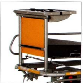
Combi-foot board and monitor shelf with patient records box