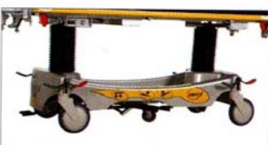
5th wheel steering