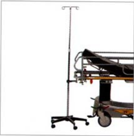
IV stand towing bracket