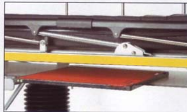
Full-length x-ray lucent elevating platform with access for x-ray cassettes from both sides.